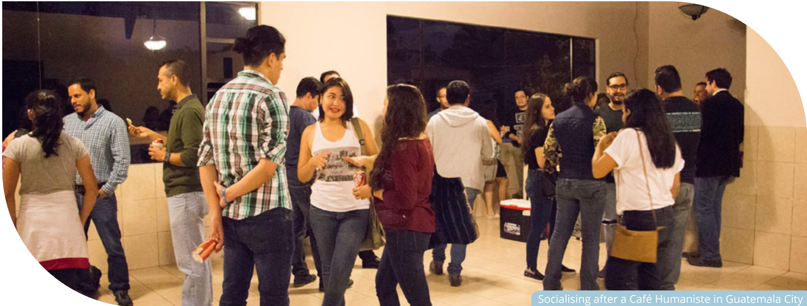
Socialising after a Café Humaniste in Guatemala City

Within our yearly funding scheme Members and Associates can also apply the Café Humaniste grants